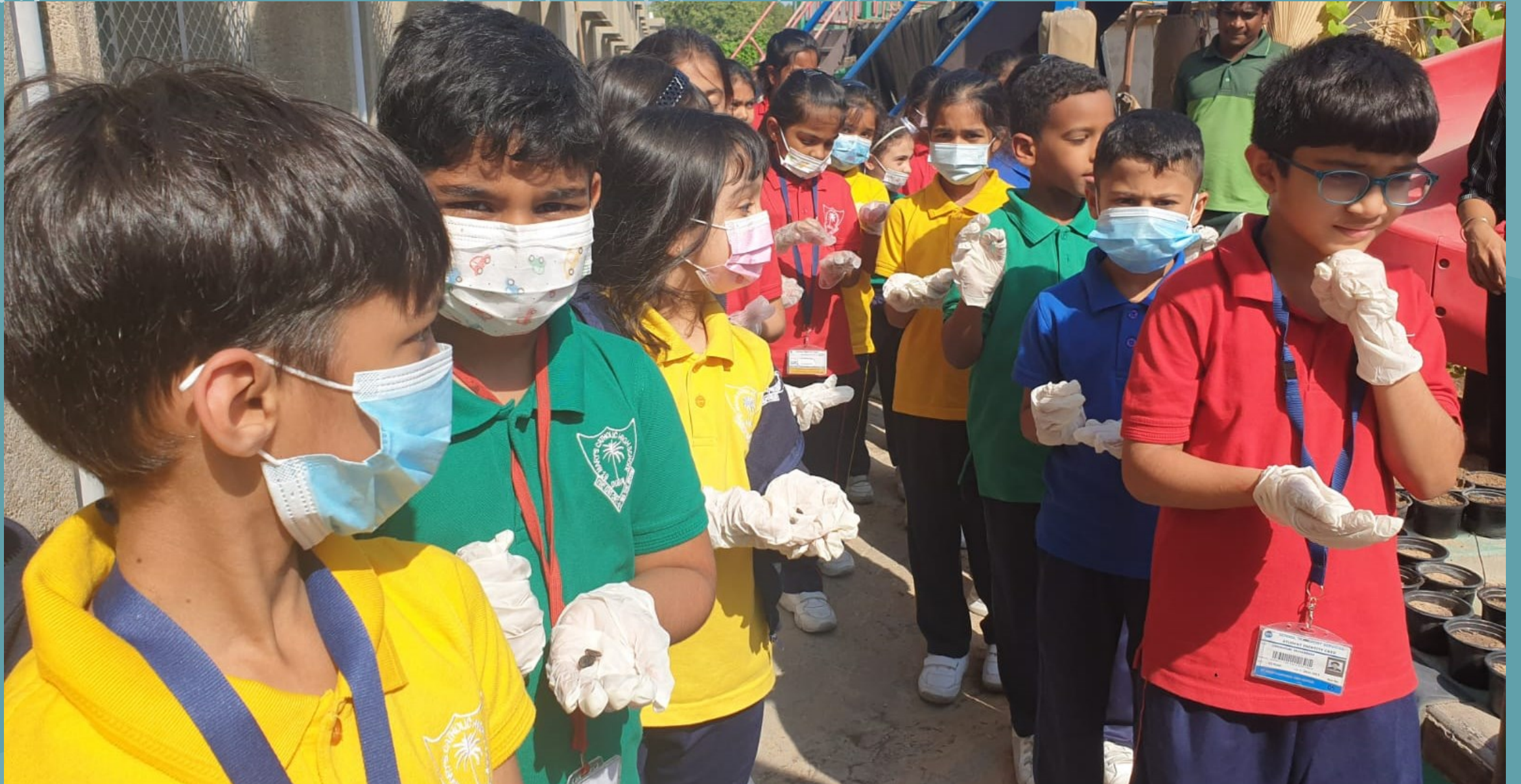
GETTING READY TO SOW THE SEEDS