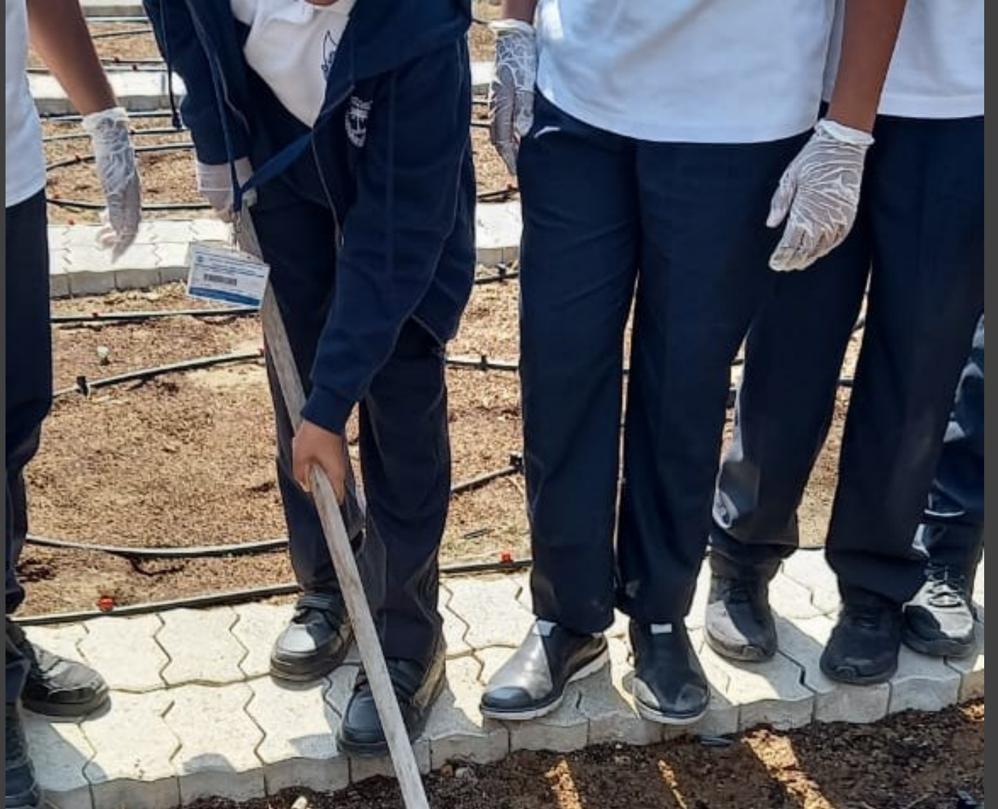
PREPARING TO TILL THE SOIL