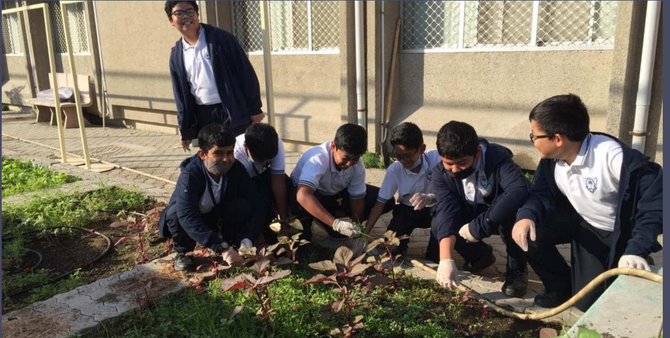
SPRINKLE IRRIGATION USED TO CONSERVE WATER