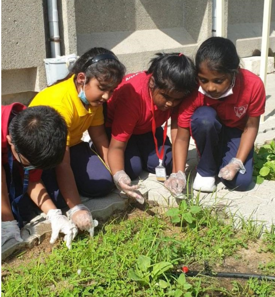
REMOVING THE WEEDS