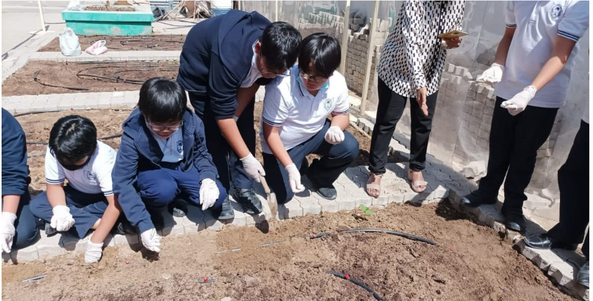
SPRINKLE IRRIGATION USED TO CONSERVE WATER