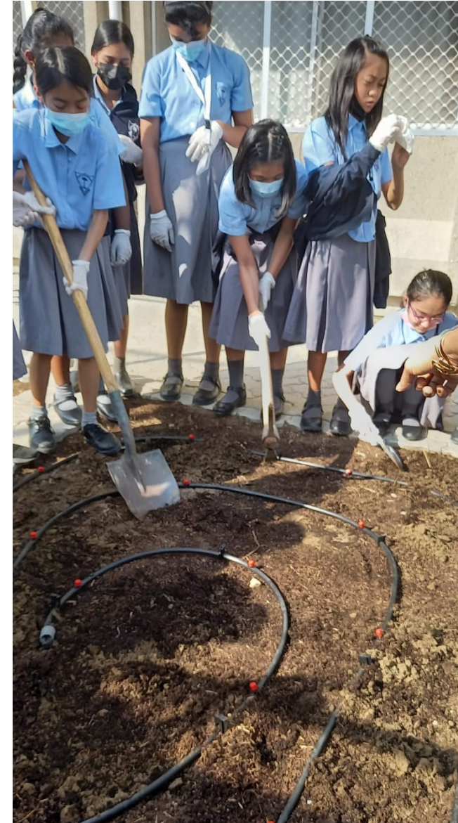
WATER SPRINKLING SYSTEM