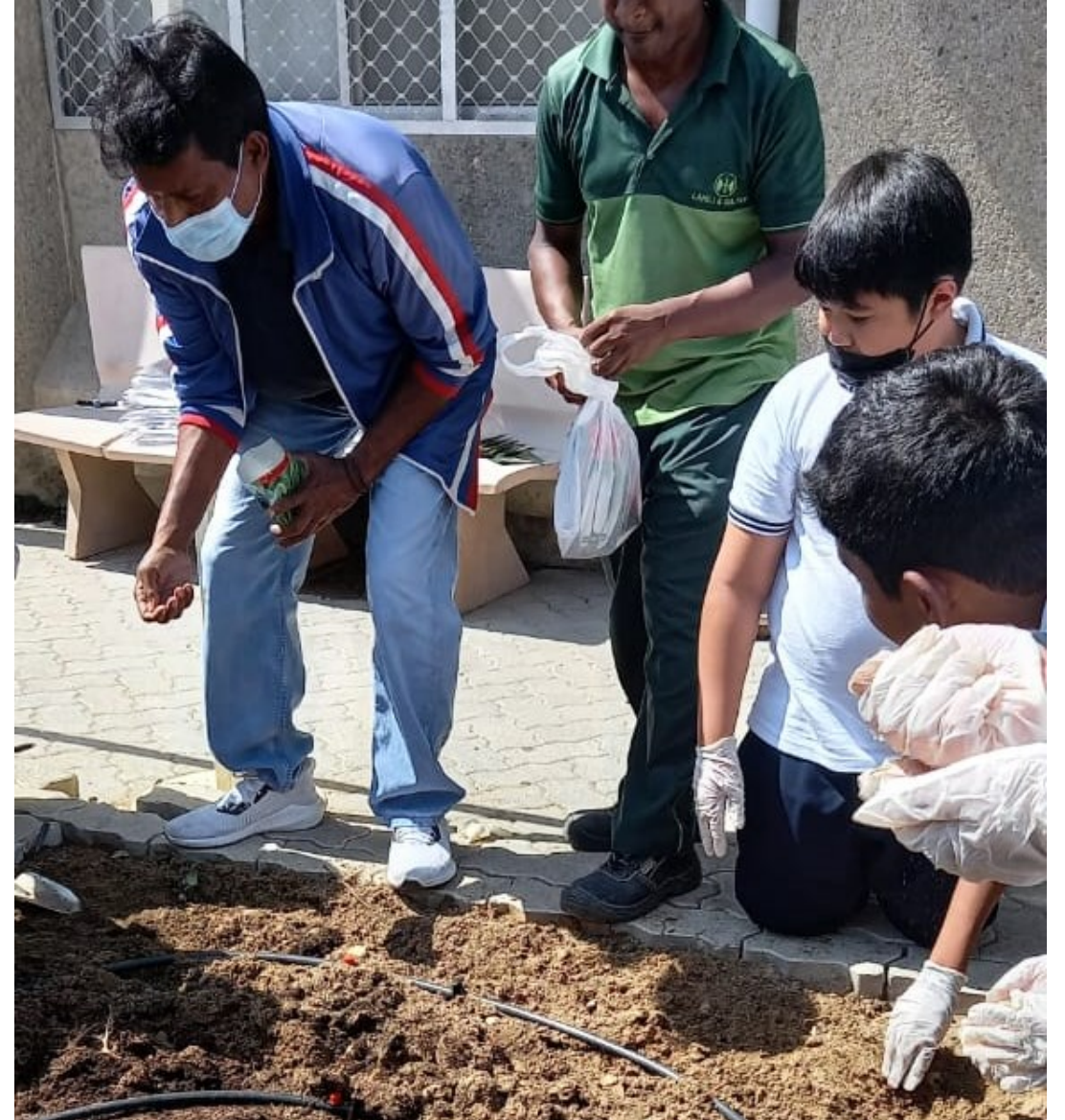
PREPARING TO TILL THE SOIL